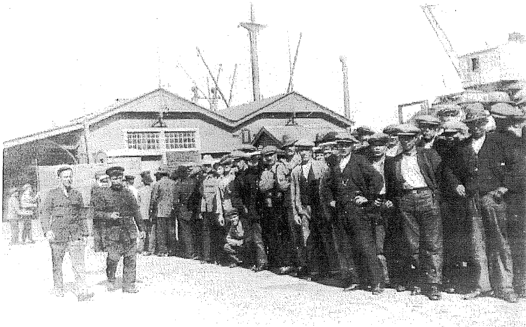
Men lined up outside D Shed during the British Seaman's Strike, October 1925

This edition of your favourite newsletter is full of information about the upcoming heritage festival. Be sure to get involved with as many of the events as you can. For further information about the Fremantle Heritage Festival visit www.fremantlefestivals.com .